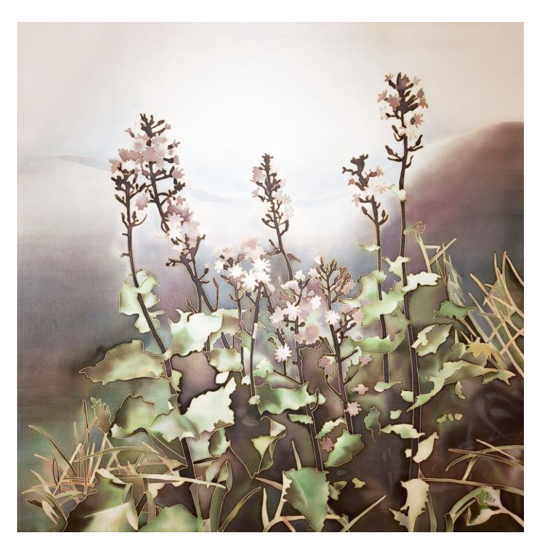
Margaryta Savina, Fog, 96 X 104 cm, silk, batik.