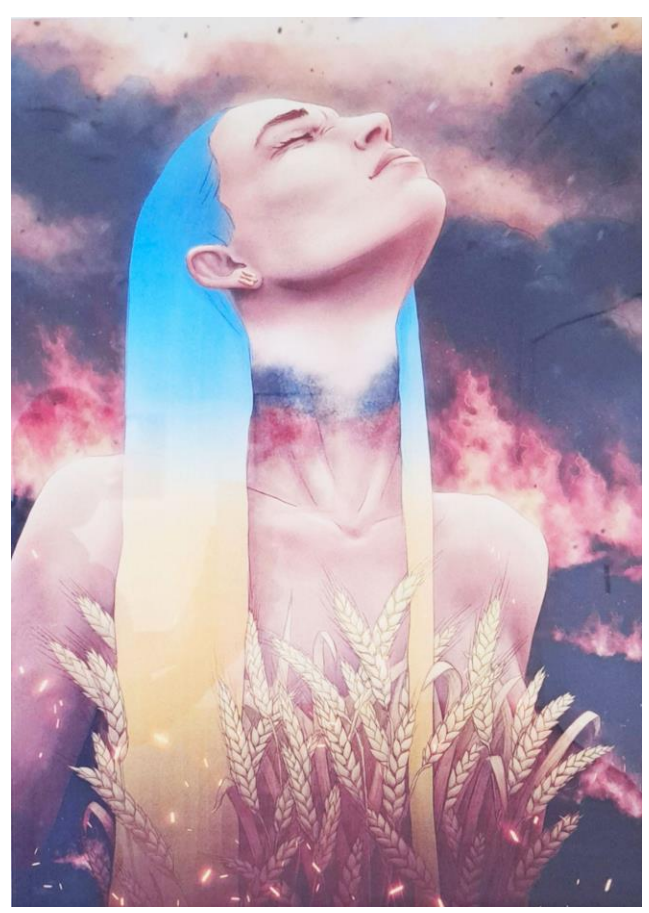
Anastasiia Chumak, Ukraine in the Flames of War, 2022, 70 X 50, digital procreate.

From August 13 to September 15, 2023, Toronto's Shevchenko Museum held a momentous multidisciplinary group exhibition of contemporary artistic works, which manifested the ingenuity of 13 Ukrainian newcomer artists. Their awe-inspiring creativity permeated the halls of the museum, leaving an indelible impression on everyone who absorbed the magnitude and meaning embedded in the artistic works on display.